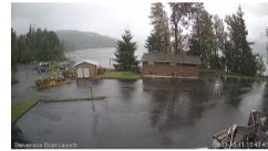
Cascade Boat Launch