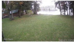
Live Bob's Beach Cam