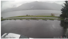
Live Kite Cam

Copyright 2022 © Port of Skamania County